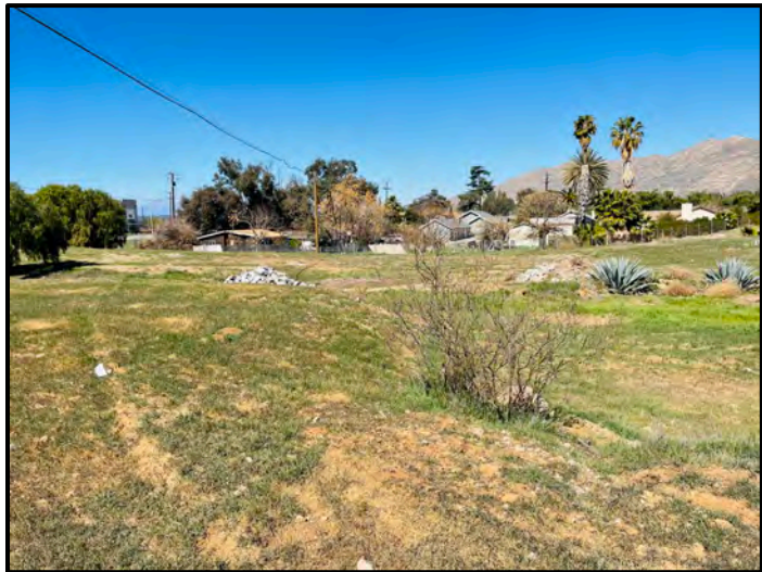
Plate 3.1–1: Overview of areas of stockpiled fill soil within the north portion of the property.

Riverside County lies in the Peninsular Range Geologic Province of southern California. The range, which lies in a northwest to southeast trend through the county, extends some 1,000 miles from the Raymond-Malibu Fault Zone in western Los Angeles County to the southern tip of Baja California. Elevations within the project range from approximately 1,522 to 1,534 feet above mean sea level and soils include Monserate sandy loam, 0 to 5 percent slopes and Monserate sandy loam, 5 to 8 percent slopes, eroded (NRCS 2022). The entire project has been disked in the past and disturbed by agricultural use. Historic aerial imagery has provided evidence that the property was used to place or stockpile fill soil. Evidence of fill soil stockpiling is noted throughout the property (Plate 3.1–1). Currently, vegetation within the project is characterized as primarily non-native grasses, which were minimal at the time of the archaeological reconnaissance.