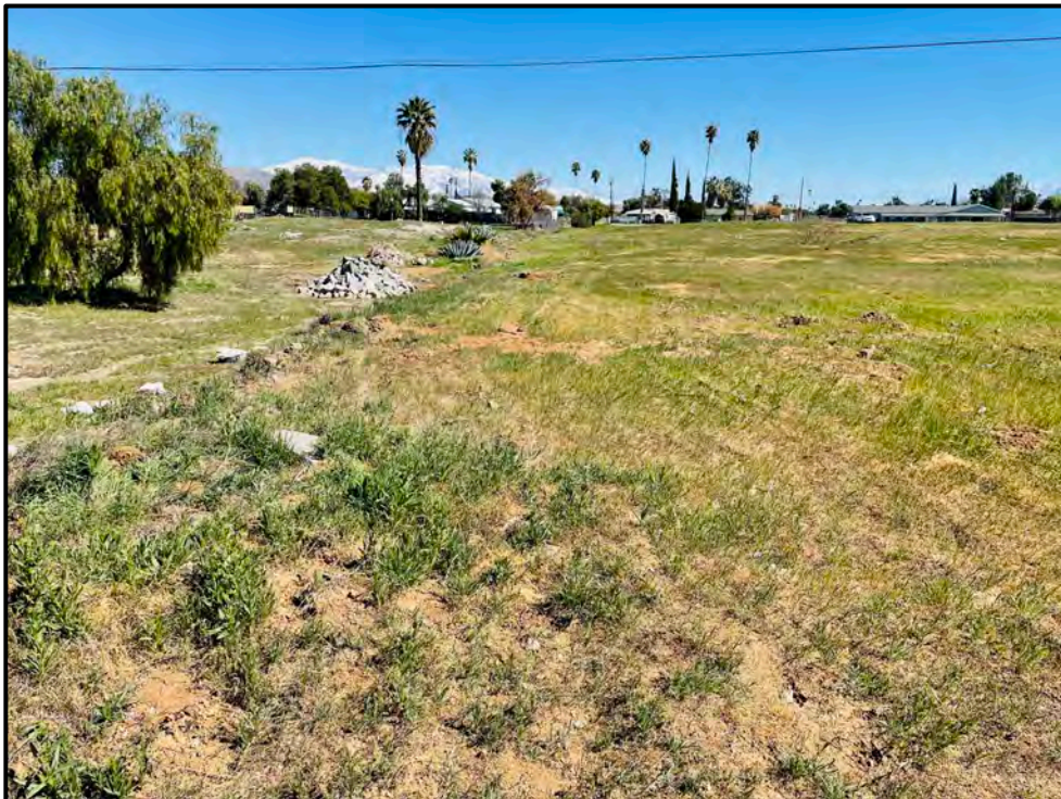
Plate 5.2-2: Overview of the project, showing evidence of debris and soil stockpiling, facing east.