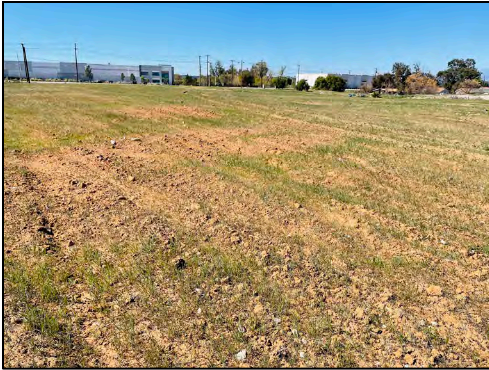
Plate 5.2-1: Overview of the project, showing evidence of past disking on the property, facing northwest.