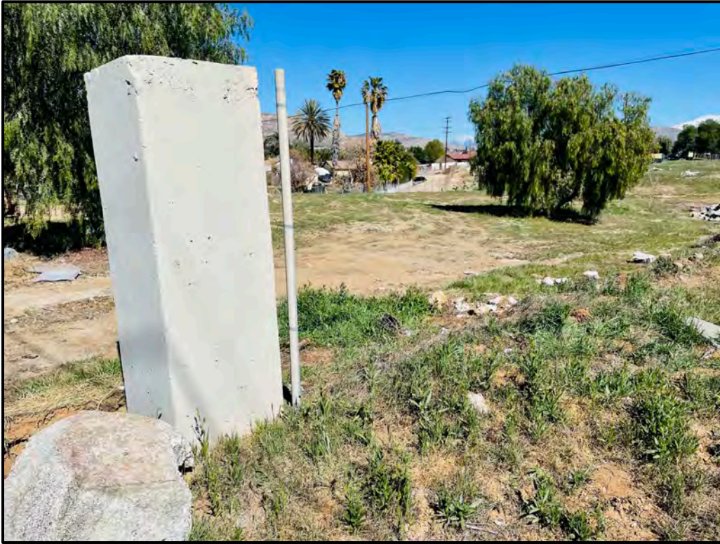
Plate 5.2–3: View of the entrance monuments present on the northwest side of the property.

The potential for buried or masked cultural deposits within the project is considered low to moderate based upon the lack of identified resources on this property and previous impacts to the property. However, archival research results and a review of historic aerial photographs indicate that multiple structures were once within the boundary of the project by 1948 and later demolished by 1994. As a result, there remains a higher potential for buried historic deposits across the project.